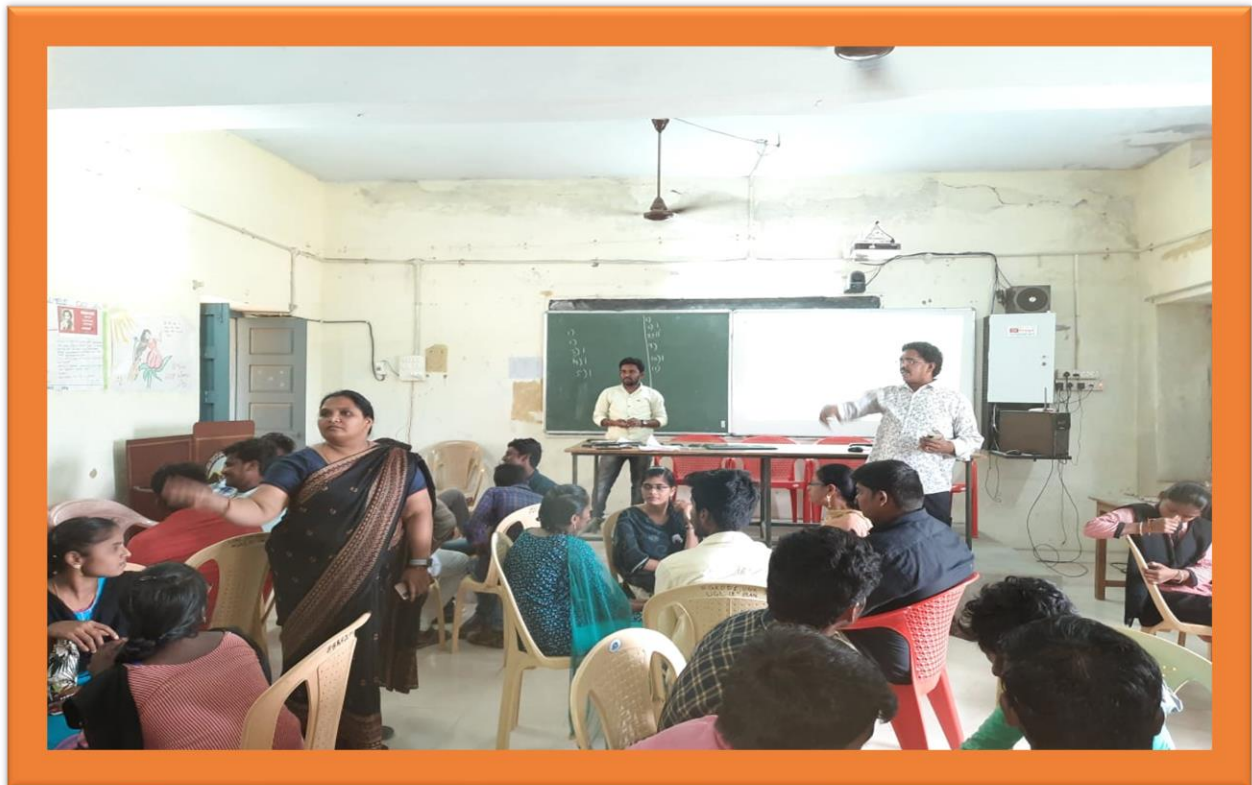
Conducted quiz competitions on the event of International Accounting Day